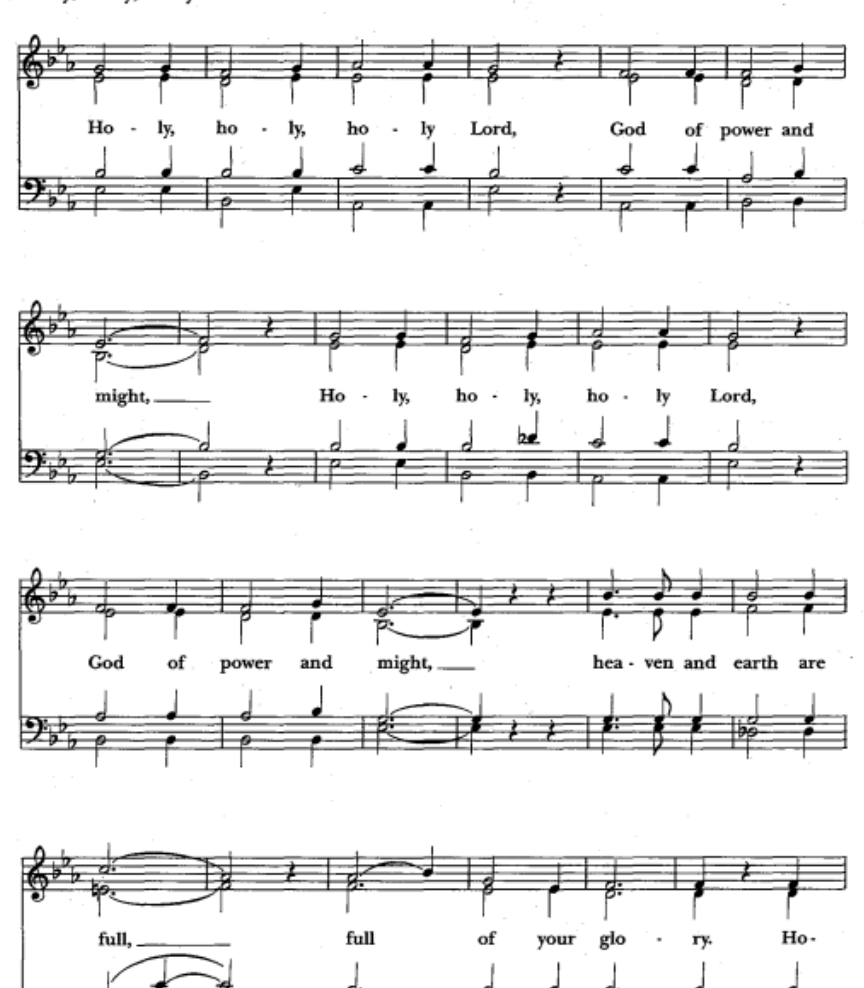
Holy, holy, holy Lord Sanctus