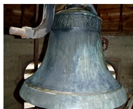
St. George's Bell