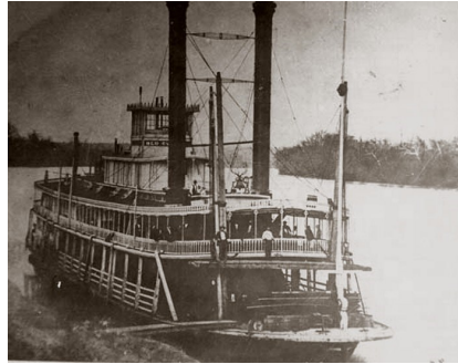
The Red Cloud